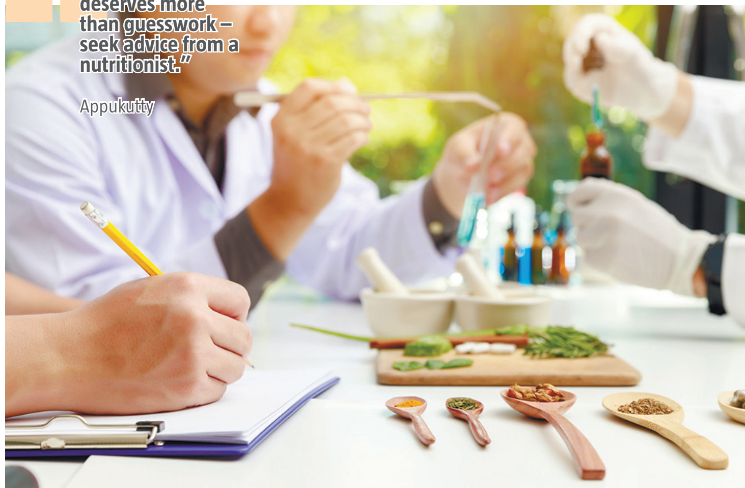
From clinics to classrooms, nutritionists are working to improve public health through food and nutrition education.

In a world filled with loud opinions on food, quiet clarity is what matters most. Choosing progress over perfection, questioning fads and listening to your body are the first steps to eating well for life.