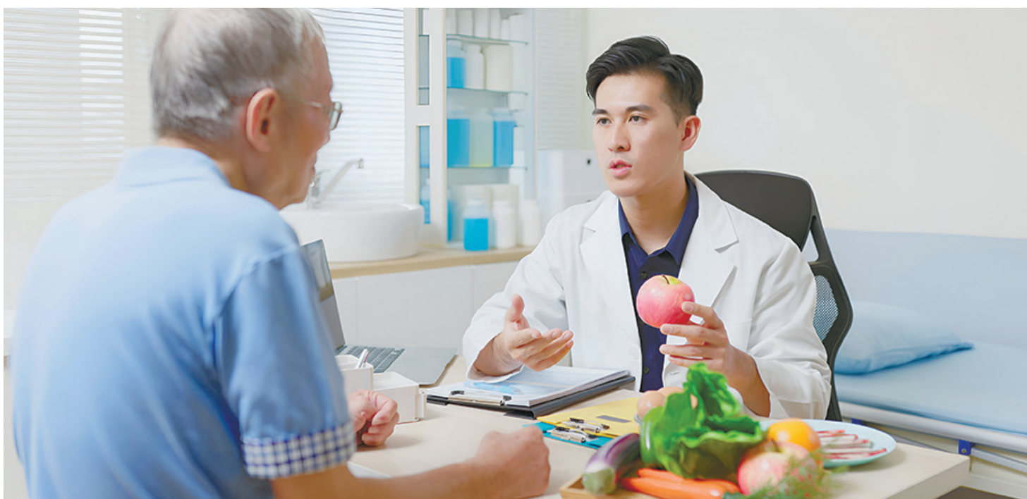
Nutritionists help individuals make informed food choices at every stage of life, from childhood to healthy ageing.

Let's face it. Most people would not hesitate to see a doctor when they are sick. However, when it comes to food, many people rely on social media tips, hearsay or advice from untrained individuals. The truth is, our nutritional needs change throughout life and knowing how to eat well at each stage is just as important as treating illness. For example, pregnant and breastfeeding women need the proper nutrients to support themselves and their babies. Infants and children require balanced diets for healthy growth and brain development. Active individuals and athletes rely on personalised nutrition to enhance performance and recovery. Not forgetting, older adults need to eat well to maintain muscle strength, support their immune system and preserve their quality of life.